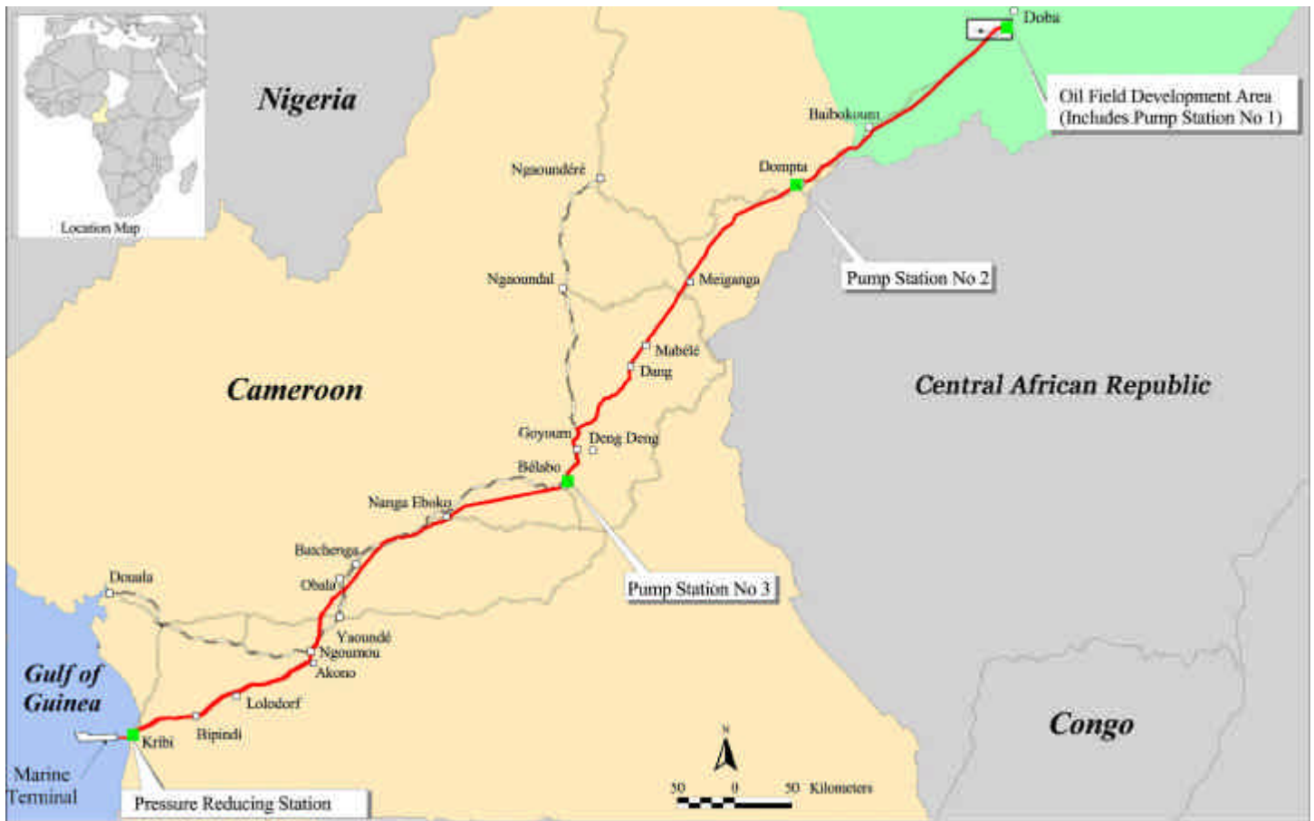
Figure 1. Geographic Context for the Chad Export Project

Key Project components in the oilfield development area in southern Chad are as follows: